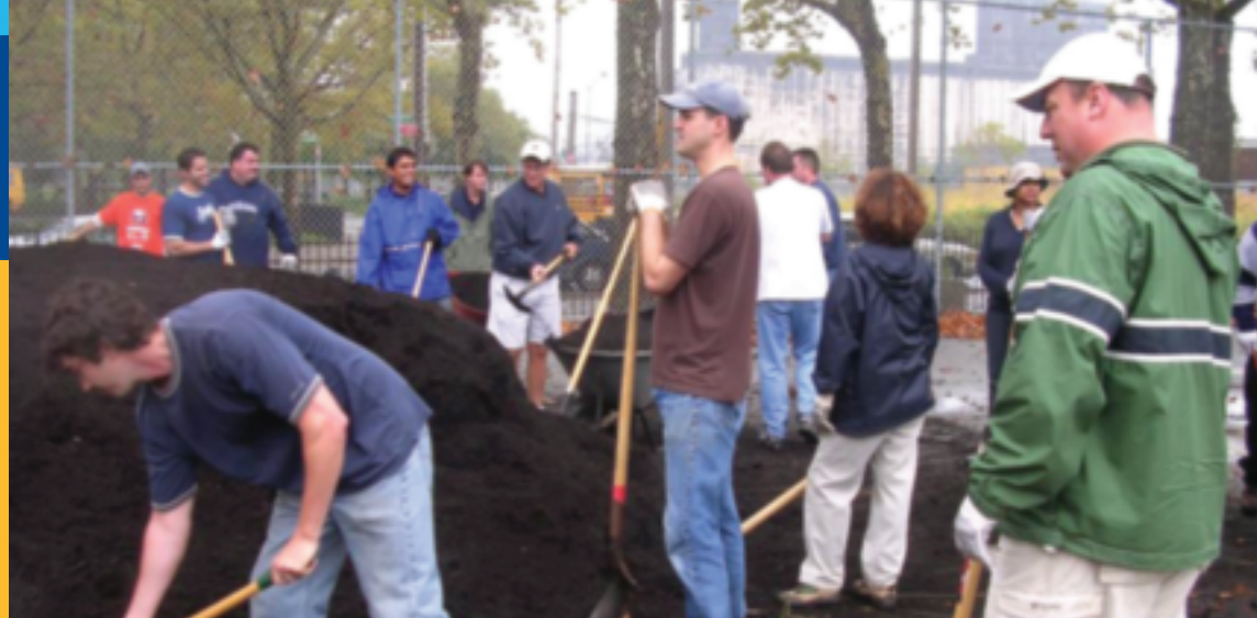
Pioneers give generously of their time to improve the community.

For general questions about Pioneering or Pioneer member benefits, please call the Pioneers Resource Center at 800-976-1914 or email us at info@telecompioneers.org